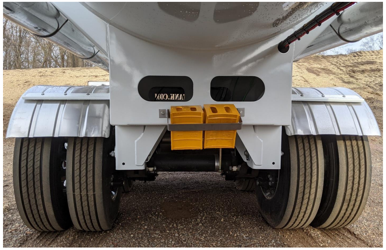
HENDRICKSON INTRAAX AAT23K INTEGRATED TRAILER SYSTEM – 23,000 LB TANDEM