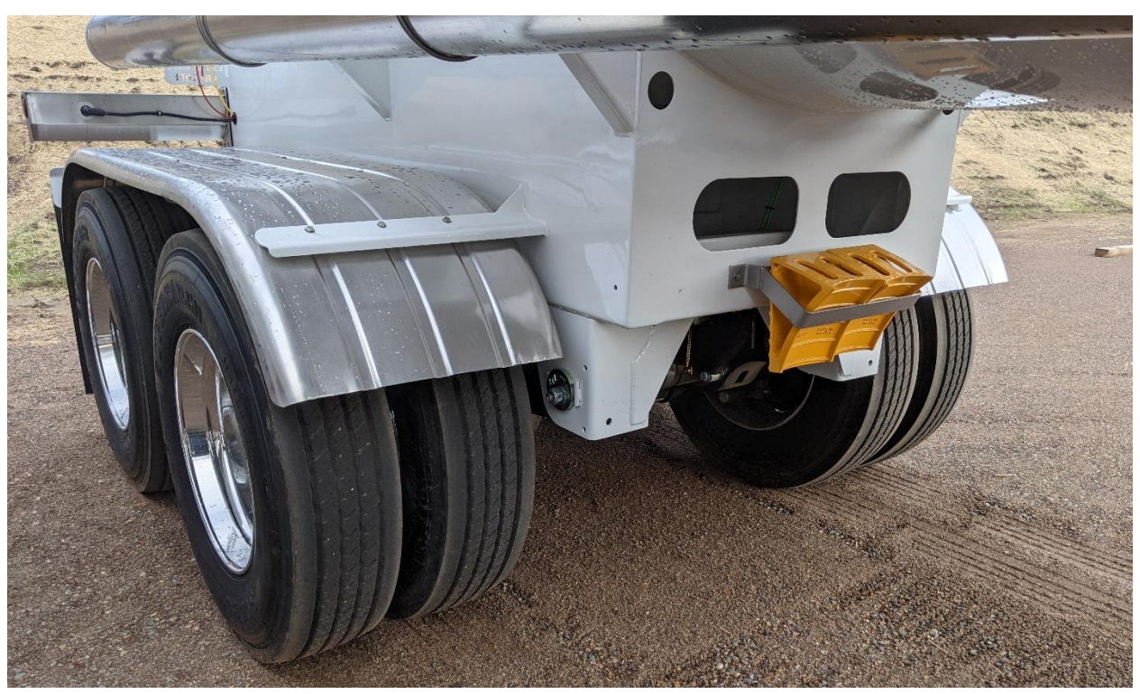
ABS DISC BRAKE SYSTEM