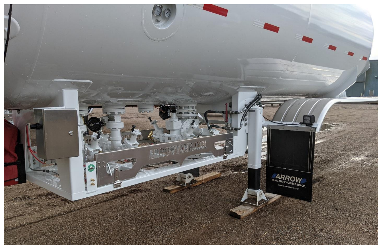
AIR CONTROL SYSTEM WITH BRAKE INTERLOCK AND AIR ACTUATORS HYDRAULIC PUMP DRIVE FLOW CONTROL VALVE NORDIC WIDE-BEAM LED WORK LIGHT (2400 LUMNES)