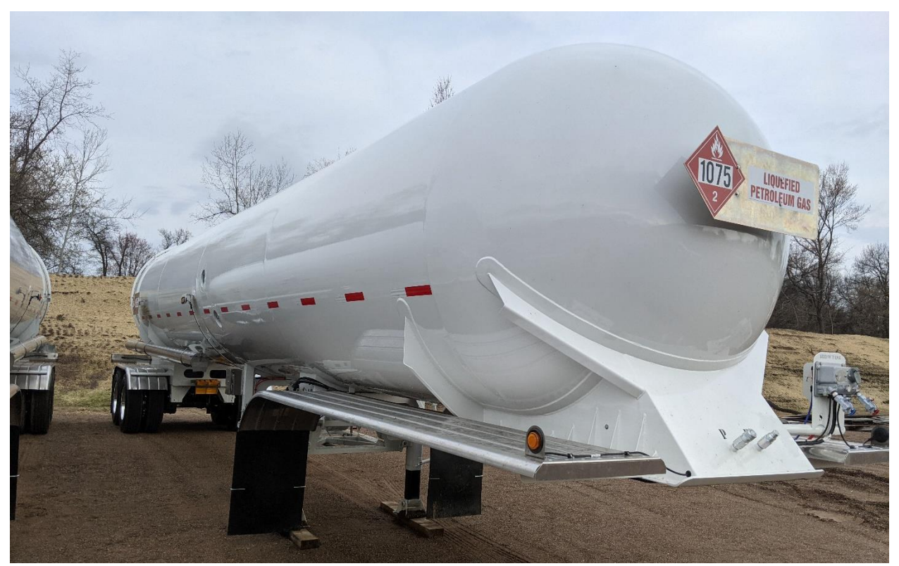
STAINLESS-STEEL FRONT FRAME AND BRACKETS