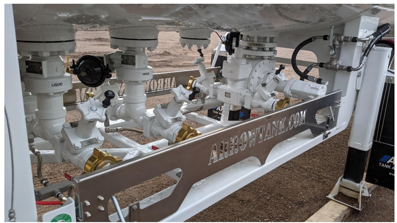
3 INCH LIQUID OPENING