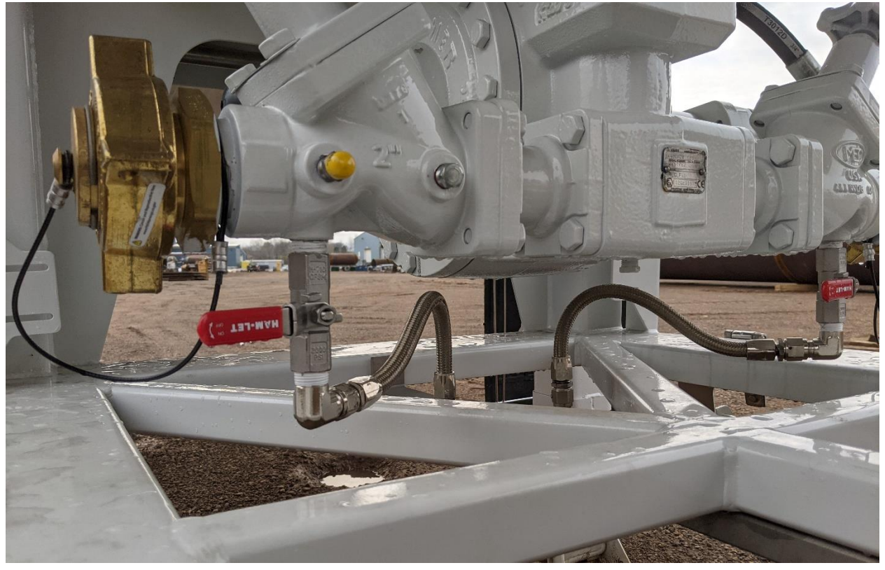
STAINLESS STEEL BRAIDED HOSE, MANIFOLD, AND HARD PIPE END OF TRAILER VENTS HIGH ABOVE MANWAY