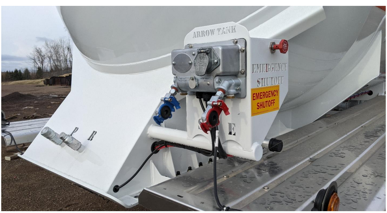
DRIVER SIDE TRAILER CONNECTIONS