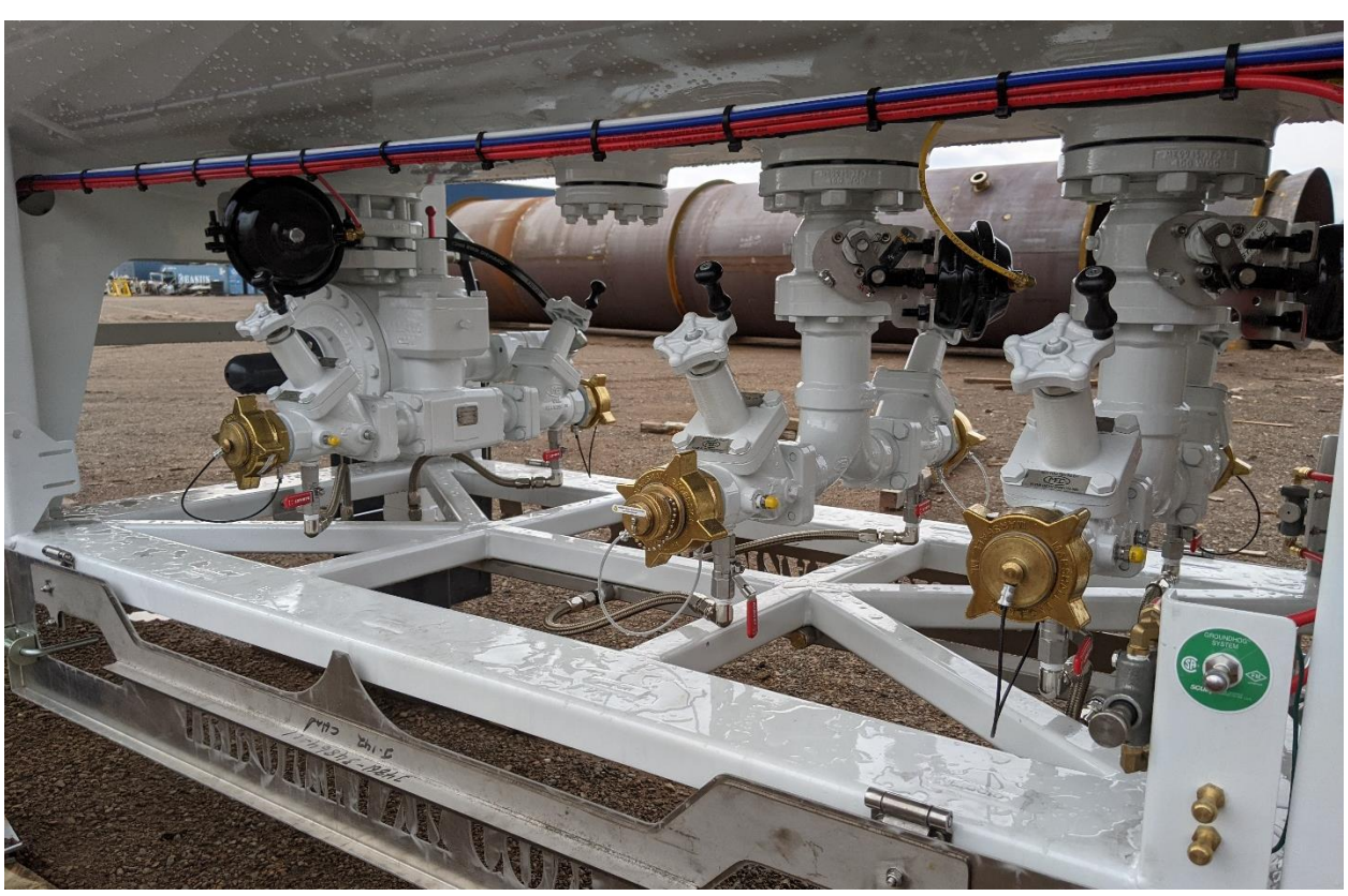
HI-FLOW SOCKET WELD TEES